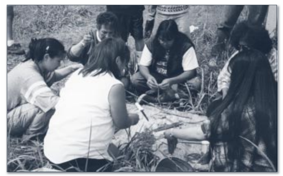
Students work on fur seal skin projects at Camp Qungaayux, August 1998.