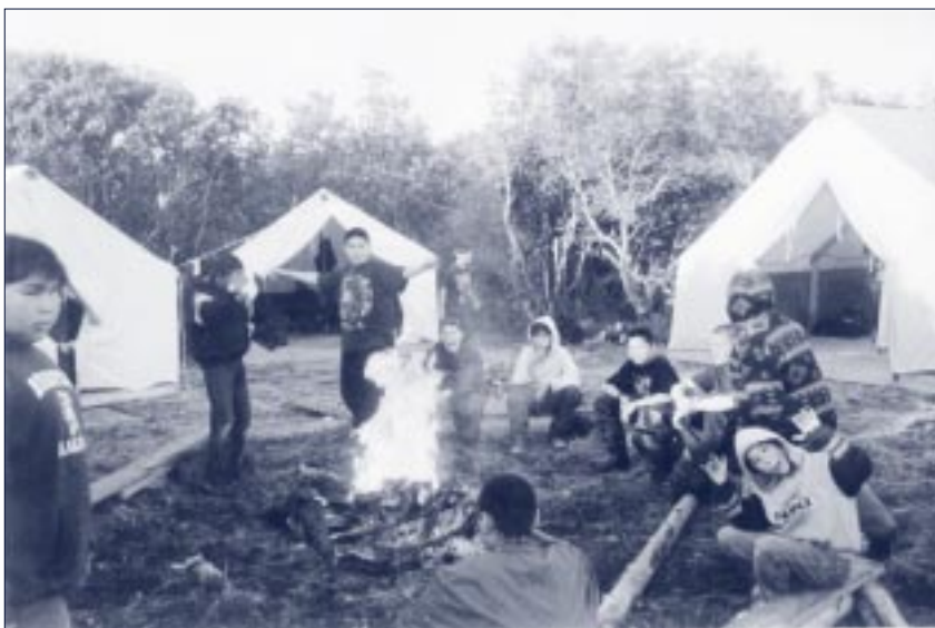
Students preparing to cook fish for dinner.

As with the camp, the activities of the season become the science and social studies. The practices passed on by the Elders and community members become the focus of research and