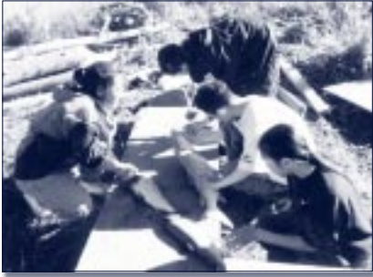
Students cutting fish.

analysis using the tools and methods of modern science. And, as with camp, the traditional wisdom will find verification under the microscope or be supported by data gathered from the internet. At winter camp stories of past adventures will be shared in tents late at night. When the students return to the village, stories of their new adventures will be written down to share with e-mail buddies far away. Such is the world our students belong to—a world that spans many millennia.