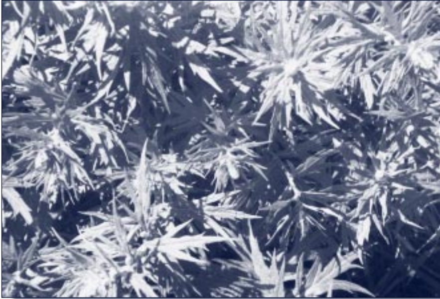
The stinkweed plant (sargiq), pictured above, is a common medicinal plant that grows in the Arctic. The 24-hour sunlight nourishes sargiq, along with other plants in the ecosystem. (Photo by Dixie Masak Dayo who is studying traditional healing and herbology.)

cooked spinach. Cool entire contents and preserve. When needed for colds or congestion apply on the chest and neck. For steaming, apply salve to boiling hot water and cover with a bed sheet—breathe the soothing moisturizing cure.