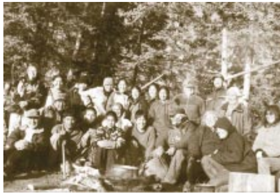
Elders, teachers, students and CHEI staff pose for a picture by the campfire.

decided where we were going, where we would stay and coordinated boat space for all the participants and sup-