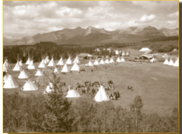
Workshops and presentations were held in over 60 teepees sprawled out over a field at WIPCE 2002 in Calgary, Alberta, Canada.

The conference objectives supported the mission statement by providing a means for indigenous nations to honor their cultures and traditions by recognizing, respecting and taking pride in respective unique practices. The conference opening and closing ceremonies, the daily sunrise