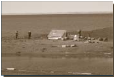
Participants carry a caribou carcass to camp.

ing experiences, students learned first hand how the Inupiat subsisted from the land, ocean and river, and about skills and technologies employed to carry out these activities effectively.